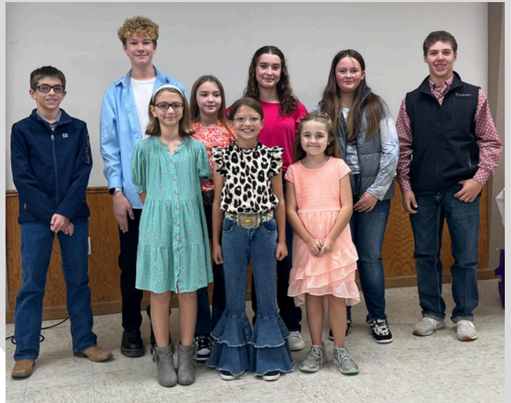
HASKELL COUNTY ACHIEVEMENT BANQUET