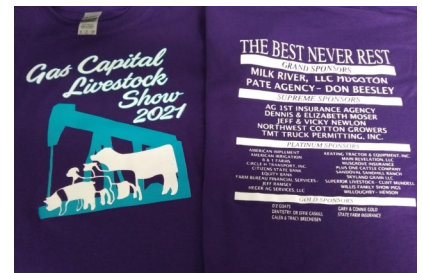
Front and Back

Several shirts are available at $10 each, Youth Small and Medium, and Adult XL and 2XL. Contact Devin, for first choice, 785-383-3884, or stop in the Hugoton Office.